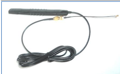
3 meter Antenna available for external GSM reception, or poor reception